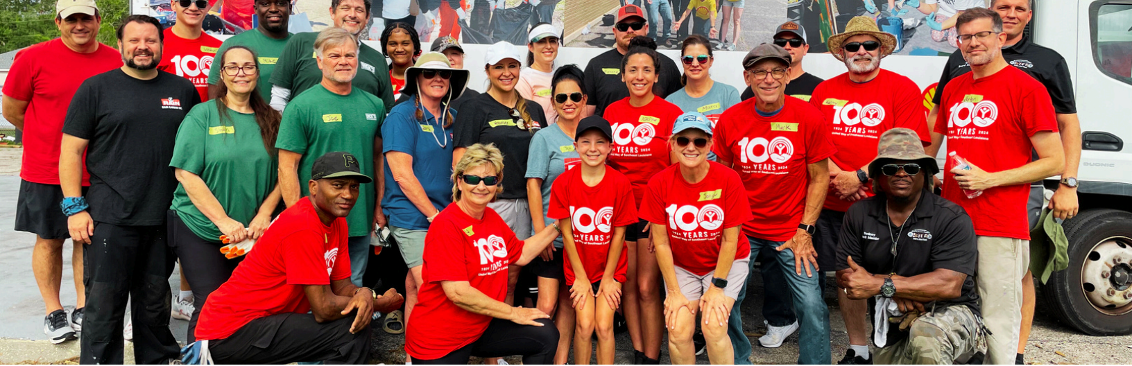
Slidell Tornado Volunteer Clean-Up