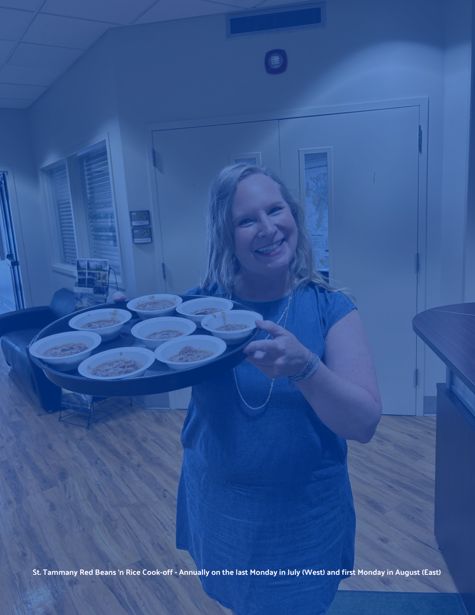
St. Tammany Red Beans 'n Rice Cook-off - Annually on the last Monday in July (West) and first Monday in August (East)