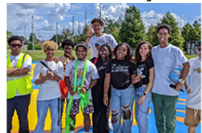
Lafitte Greenway BELite Youth Mural Arts Project: Basketball Court Revival