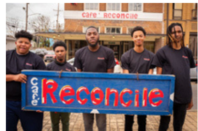
Reconcile: Workforce Development Summer Success Program