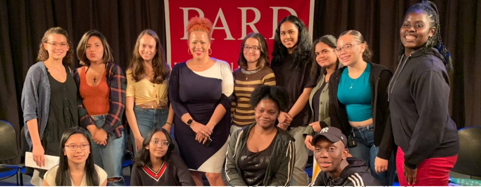
Bard Early College: Bard Early College New Orleans