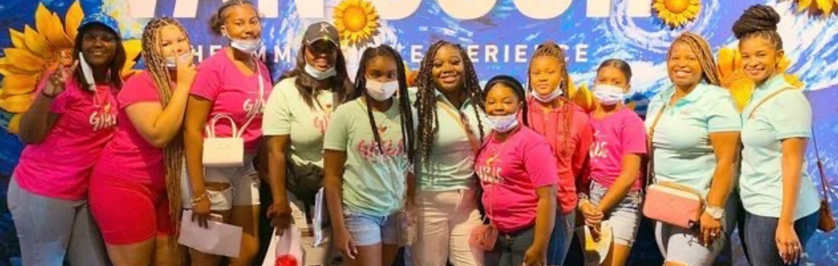
Dinerral Shavers Educational Fund: GIRLS NOLA Initiative