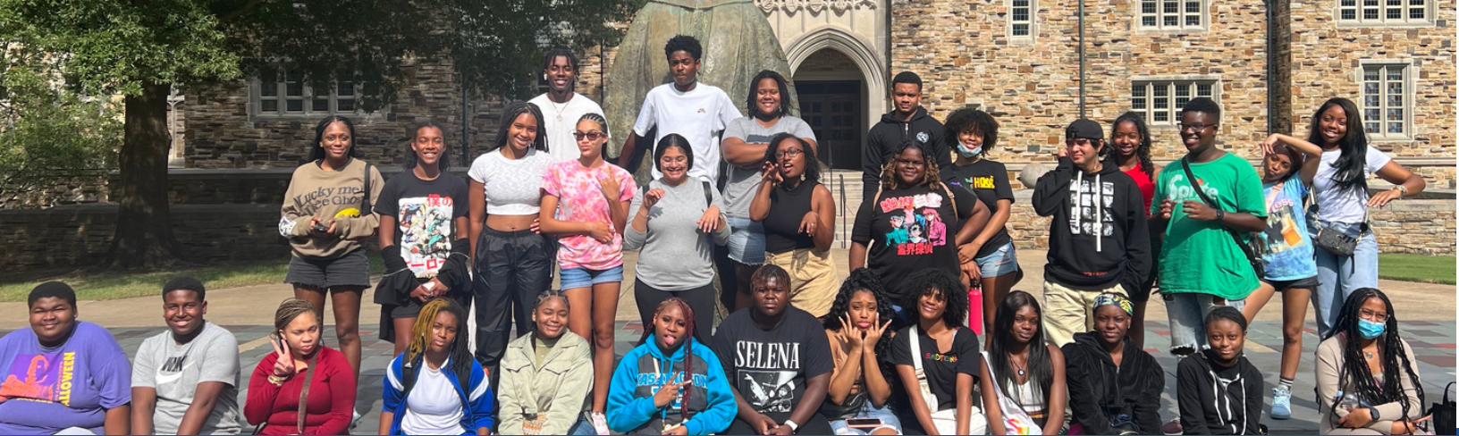
College Track: Summer College Access Programming for New Orleans Scholars