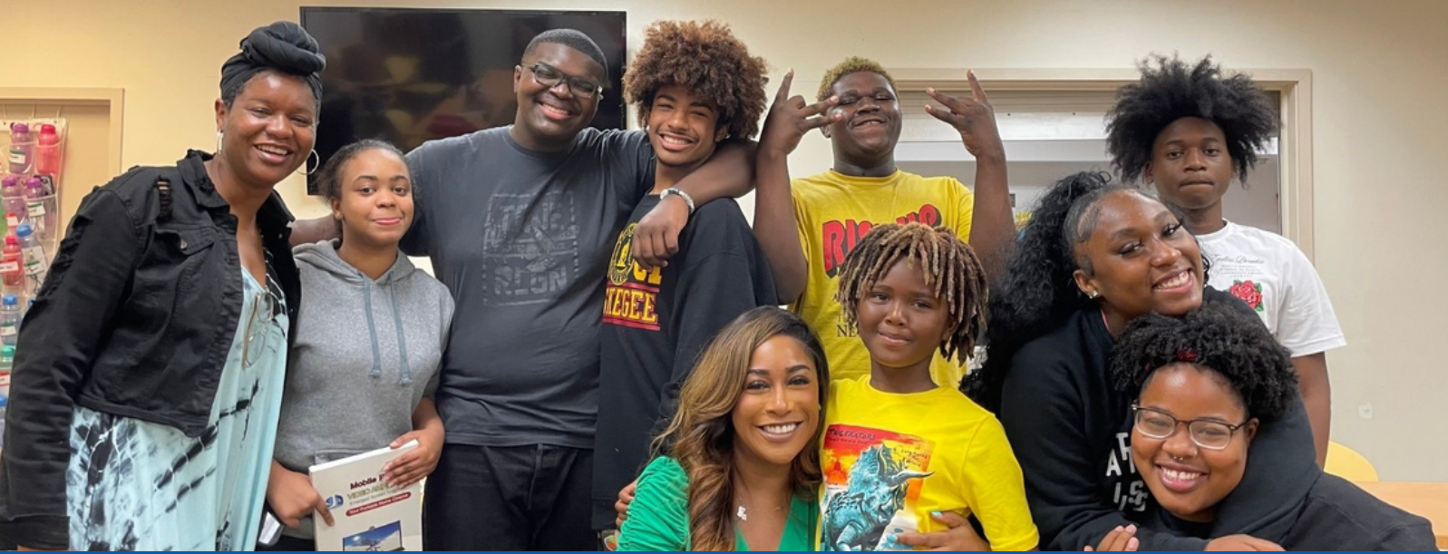
About FACE: Summer Social Set 22