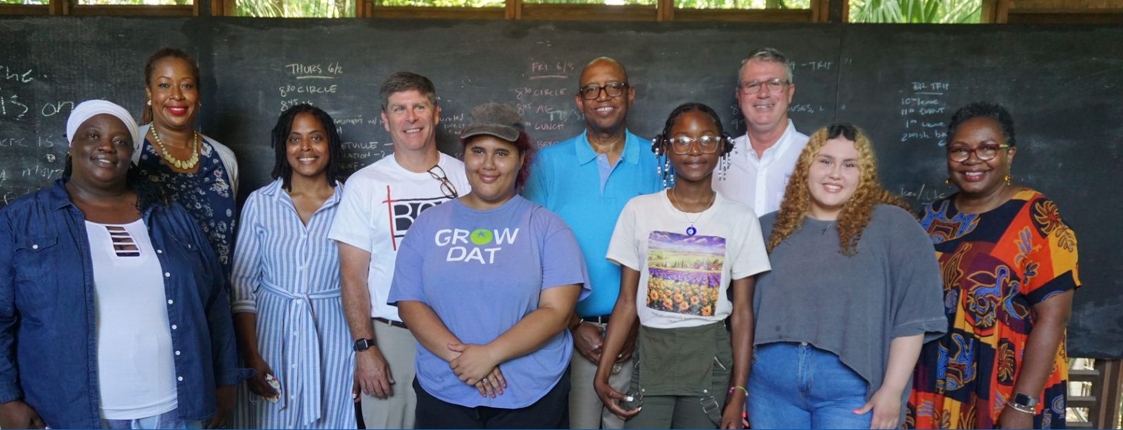
YMP Summer Grant Announcement