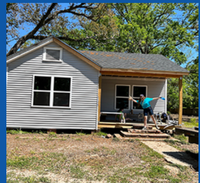
*Name changed for client privacy